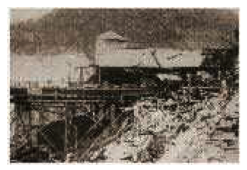
Figure 2: Mt Kembla Colliery

The second instigating historical place is Meroogal (Fig 3) where the lives of four successive generations of Thorburn women living through hard times are acknowledged (Sydney Museums, 2016). These women are remembered as individuals contributing tirelessly to their well-being through their relationship to each other and to community—just as the surviving Mt Kembla widows.