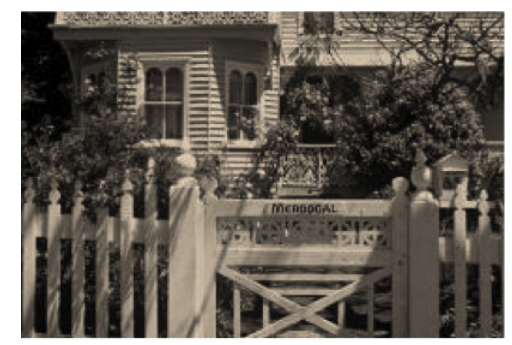
Figure 3: Meroogal