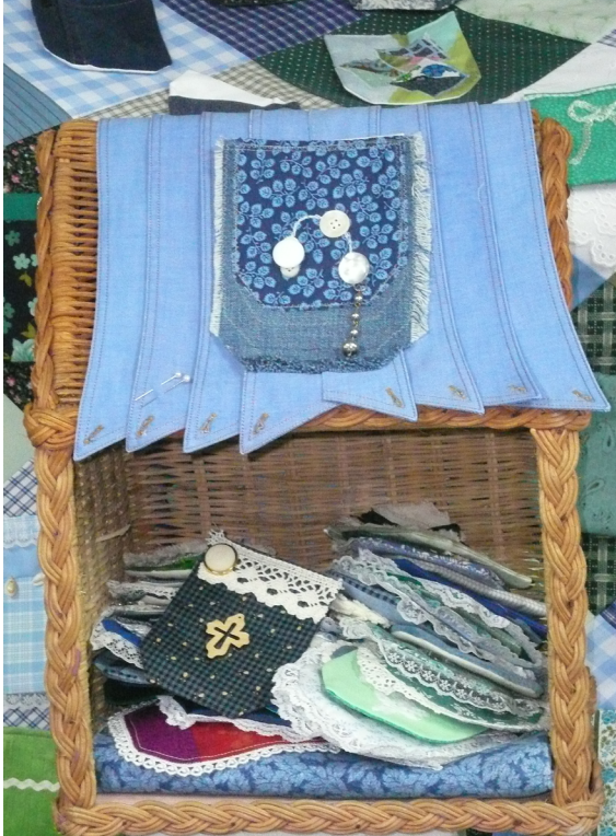
Figure 11 & 12: Small hut of pockets (Peitsch, 2011)