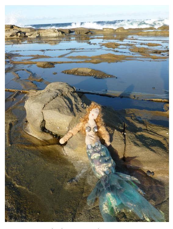
Figure 13: Myrtle the Mermaid

Pictured below (Fig 14) is the installation setting of the pockets created during the Women's Retreat weekend. In this formation, the pockets were the central focus of a unique-to-this-denomination, 'all women led' worship service.