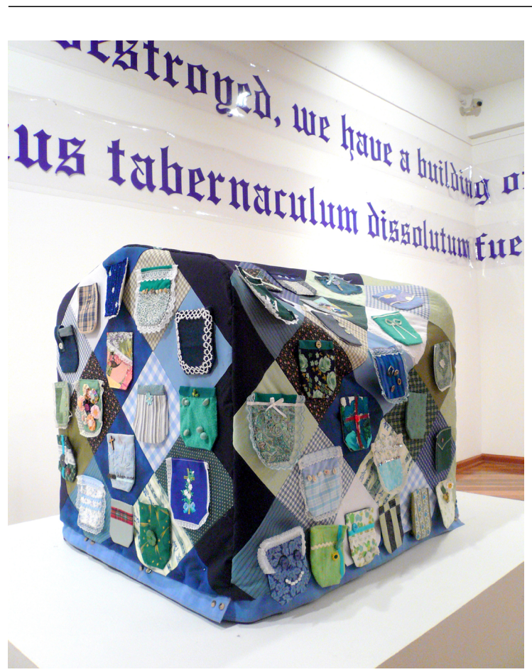
Figure 1: The Prayer Pocket Place, 2011