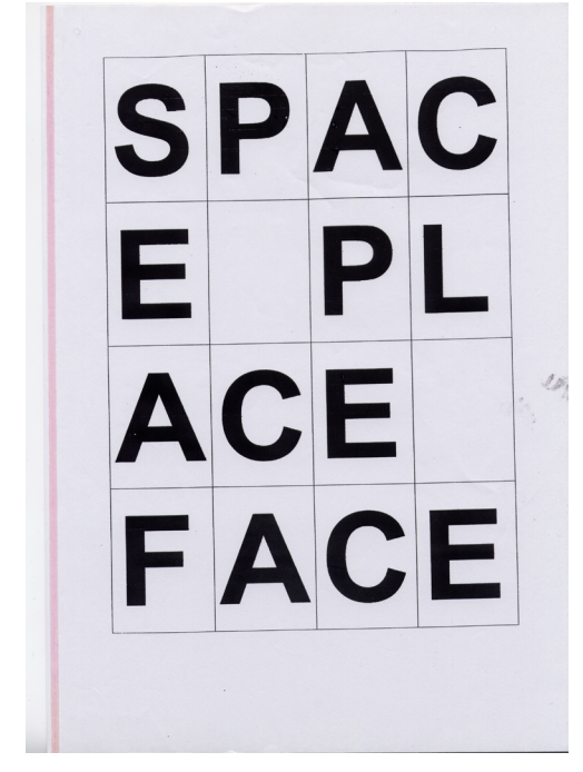
Figure 6: Theme Grid of the author's MFA (Peitsch, 2008)

One appreciative and articulate workshop participant wrote, 'I think the presentation was a very successful juxtaposition/intermarrying of theory and practise. You obviously knew what you were doing having done the academic groundwork so were able to show us the essential characteristics of narrative through performance. Well done.' (Wollongong, 2008). This general comment seems to apply to many of the workshops I conduct. And, I do feel 'on a mission from God' to quote the film The Blues Brothers (Landis 1980). 'The power that can transform, redeem, unify and order has moved in continuous process from a transcendent world into the inner being of artists themselves' (Norris, 1996, p. 59) so John Cobbs has written. Even my purple hair which is worrying and in fact, alienating to some private school systems I discovered, is welcomed in the creative circles in which I nominate to move (2012). Like my unnatural purple hair, alternative teaching and learning practises and places are a natural way ahead for me (2008). Pockets is one such chapter in this line of thinking.