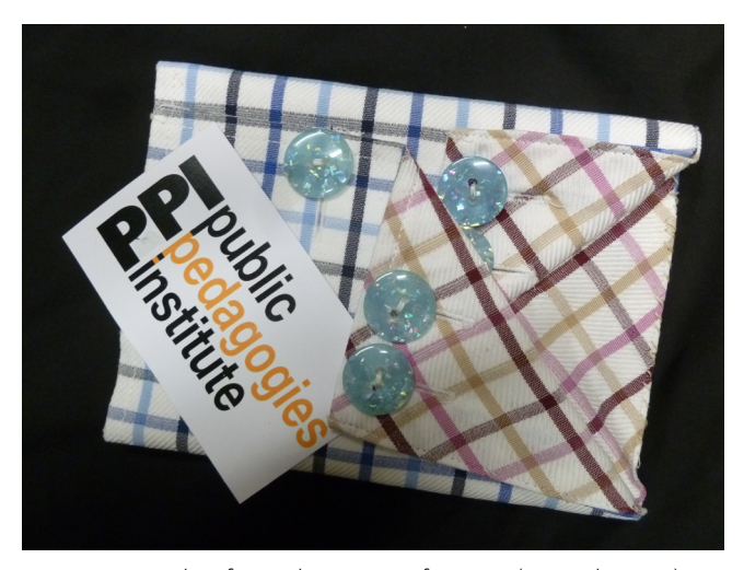
Figure 15: Pocket from the PPI conference (Peitsch, 2015)

The last small pocket (Fig 15) to be added in The Prayer Pocket Place story is the one filled by participants at the conference, Turning Learning Insideout (Charman, 2015) during my session. It fittingly holds the prayers of those who, in many ways, engage alternately with the story of their 'island home' Australia, as does Tim Winton (2015) who, like the authors of these tiny supplications, sees the earth as home and so, sacred. For those who can, this means the sacredness of place and belonging is here for the taking.