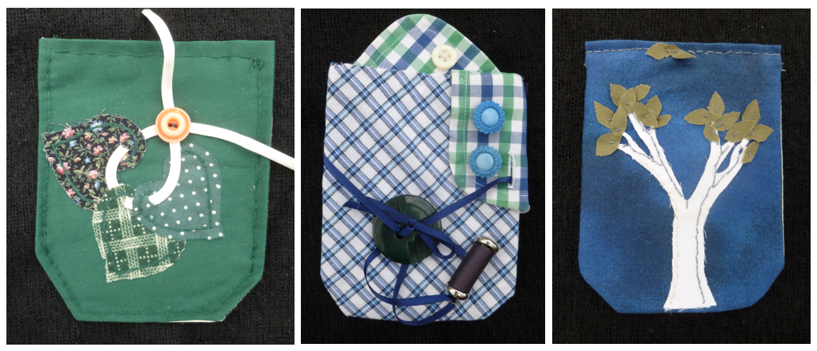
Figure 4: Examples of pockets from workshops