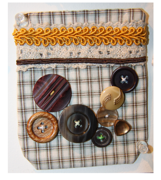
Figure 9: Sample pocket with buttons (Peitsch, 2011)