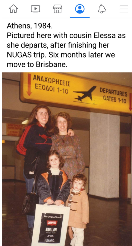
Figure 1: My Migration Beginning Shared via Facebook.

It is through stories that we can see ourselves in different ways and form a new self (McAdams 2001). Participatory narrative inquiry (Kurtz 2014) researchers gather stories to better understand a particular circumstance or providing the space for stories to be told for the first time. Sharing my own migrant experience with the participants made this methodology appropriate and authentic, especially as I was using the medium of new media (see Figure 1).