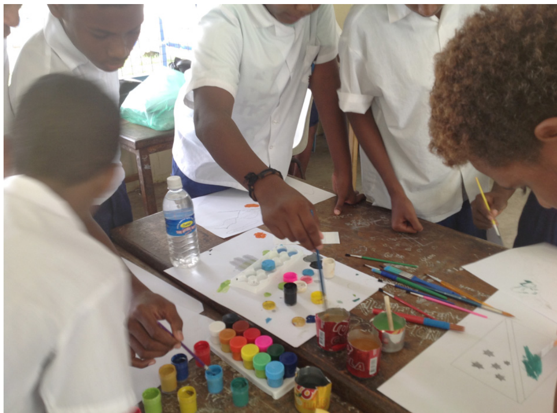
Figure 1: St Nicholas students at their paint station

We took the opportunity to visit St. Nicholas College, as staff there had expressed interest in participating in the project. After a brief chat with the Principal, we were given an offer to work with a class of 30 boys at year eight level, as these students would otherwise have had no teacher for a couple of periods. We were introduced to the class by the Vice Principal and explained the project. The process would require each participating student