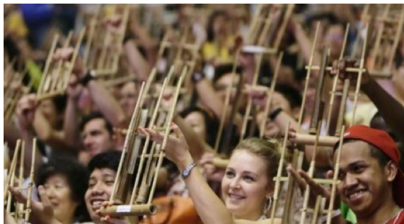
Figure 1: Angklung

The political and the educational dimension come together in the idea of 'public pedagogy'. Although much work on public pedagogy has focused on the analysis of how media, culture and society function as educative forces... [T]he idea of public pedagogy can also be understood in a more programmatic and more political way, which is as an educational intervention enacted in the interest of the public quality of spaces and places and the public quality of human togetherness more generally (Biesta 2012, p. 684).