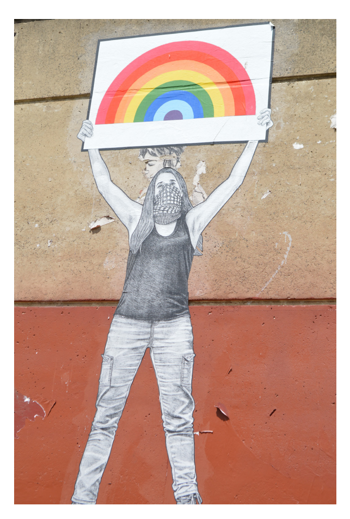
Figure 1: Public Mural (Photograph: Karen Charman, 2017)

Welcome to the second edition of the Journal of Public Pedagogies . At the time of writing this editorial in Melbourne, Australia we are immersed in a public debate on same sex marriage as the Government conducts a postal vote on this 'issue'. It has been hard to escape the publicness of opinion and the association of the 'right' to marry as argued as a threat to heterosexuality and the demise of the nuclear family. Specifically, the idea that being Gay will be become so 'normalised' it will be encouragingly taught about in schools. The argument stops just short of the statement 'they are going to teach you to be gay'. I would argue for strong resistance to public rhetoric designed to further 'other' marginalised people such as the LGBTQI community. What this debate has crystalized, among other things, is the necessity and problematics of knowledge constructions outside and inside of formal institutions. As people engaged in the theories and practices of public pedagogies we are called on to think about where knowledges reside and who is determining of what knowledges are valued. Constructions of knowledges are never neutral despite how benign they may appear.